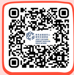
藥健同心博愛醫院社區藥房 PHARM+ Pok Oi Hospital Community Pharmacy