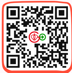
HA Go 網站 HA Go Website