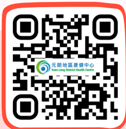
元朗地區康健中心 Yuen Long District Health Centre