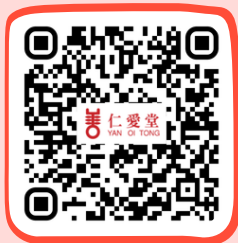
仁愛堂鄭丁港善心藥物中心 Yan Oi Tong Community Pharmacy