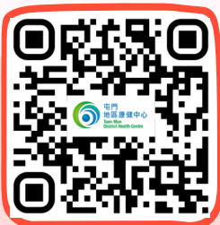
屯門地區康健中心 Tuen Mun District Health Centre