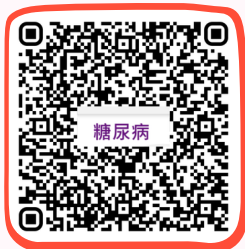
糖尿病資訊 Diabetes Mellitus Information